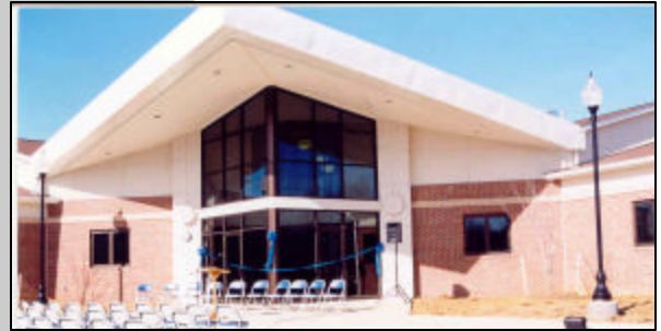
The Joseph A. Gilmore, Sr. Center

Well, if you haven't guessed, I'll tell you who I am. I am THE JOSEPH A. GILMORE, SR. ADULT DAY CARE CENTER . Please call me on (301) 808-9808, so that I can share with you the many services that I have for you and your family.