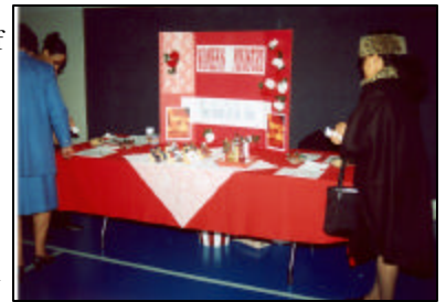
Women’s Ministry Recruits. The ministry sponsored a booth at the recent Mount Ephraim ministry fair.

We look forward to more interesting offerings from the Women’s Ministry in 2005.